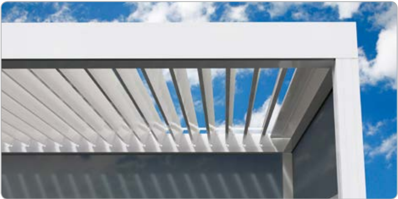
In open position: adjustable sun protection and ventilation