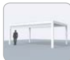
Pivot side equipped with integrated Fixscreen®

These extensions can easily be integrated afterwards.