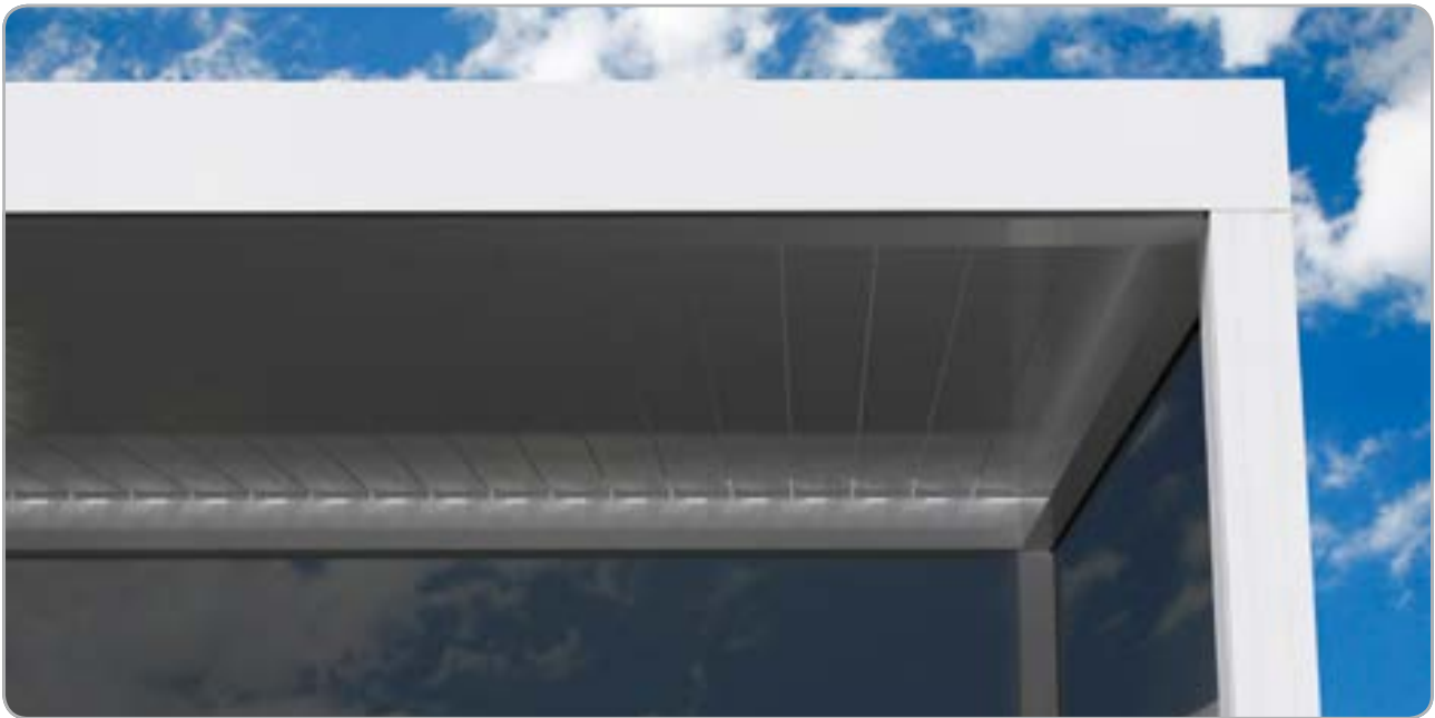
In closed position: the waterproof blades offer a beautiful, even and smooth finish below