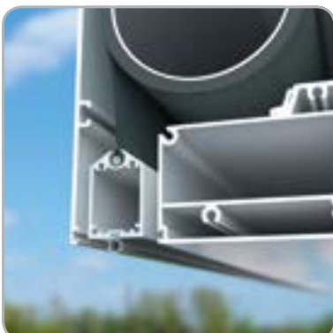
Integrated sun protection: the bottom bar disappears into the box