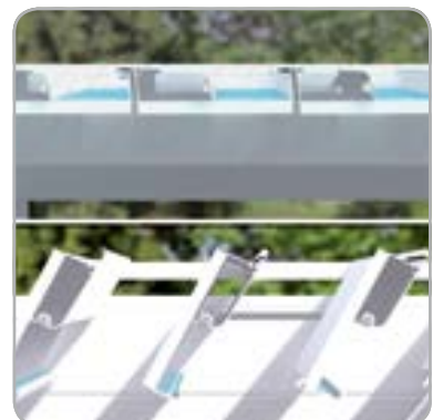
Controlled water drainage even when the blades are opening