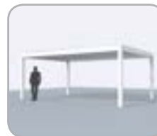
Stand-alone (4 columns)