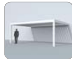
Fitted to an outside wall (2 columns)