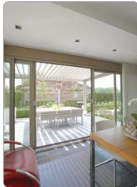
Integrated vertical windresistant sun protection screen based on Fixscreen® technology