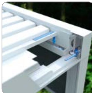
Efficient concealed water drainage