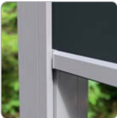
Integrated side channels + Fixscreen® in column