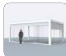
Pivot and/or span side equipped with glass sliding walls whether or not combined with integrated Fixscreen®