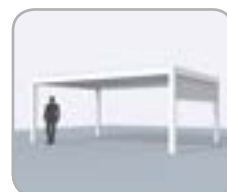
Span side equipped with integrated Fixscreen®