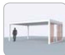
Span side equipped with Loggiawood® or Loggiascreen® 4FIX