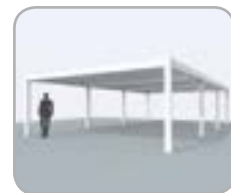
Multiple parts joinable both or pivot and span side