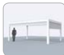
Combination of integrated Fixscreen®