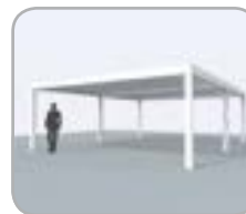
2 sections joinable on the pivot or span side