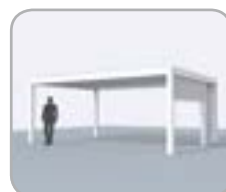
Pivot and/or span side equipped with integrated Fixscreen® and sliding door using Loggiascreen® 4FIX or Loggiawood®